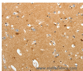
Immunohistochemistry of paraffin-embedded Human brain tissue using TNR Polyclonal Antibody at dilution 1:60